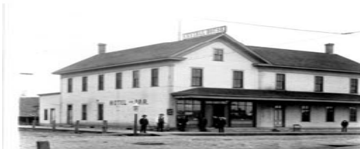
Central House - 1910